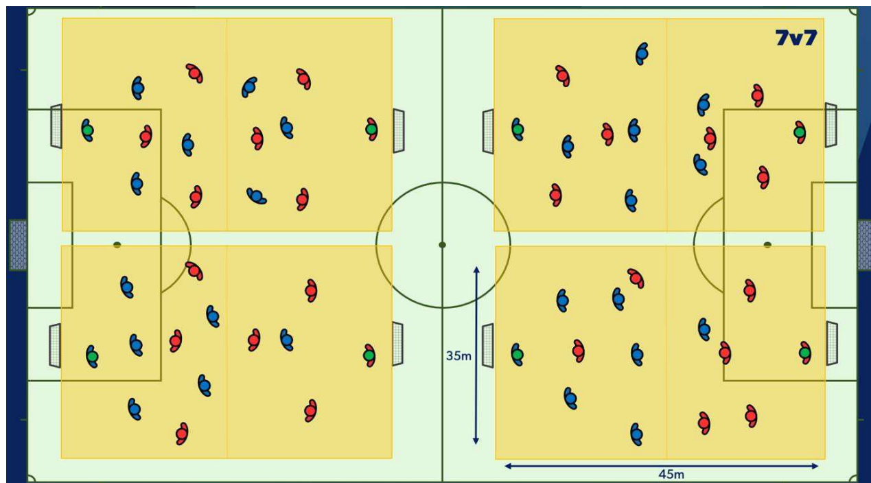
Playing Formats boys and girls aged Under 8 & 9