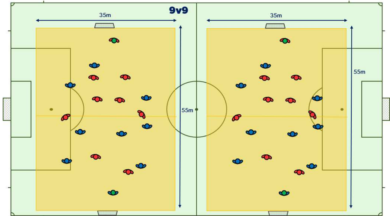
Playing Formats boys and girls aged Under 10 & 11